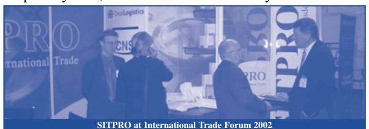
SITPRO at International Trade Forum 2002