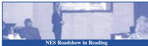
NES Roadshow in Reading